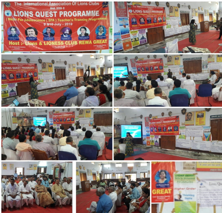
9th to 10th July 2019 - Workshop in Action