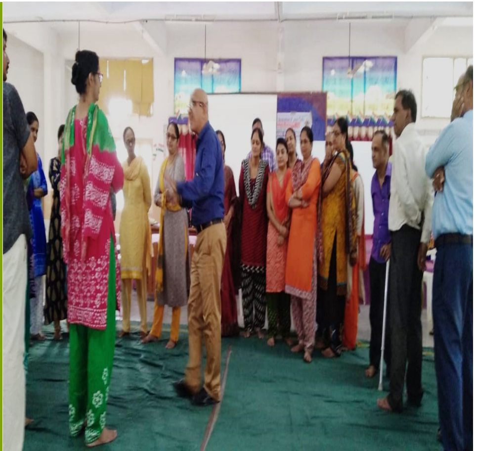
19th to 20th August 2019 - Workshop Activity