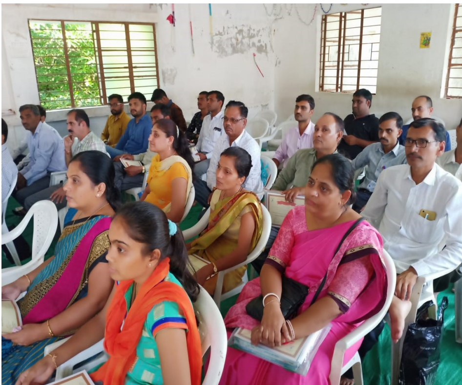
28th to 29th August 2019 - Workshop in Action