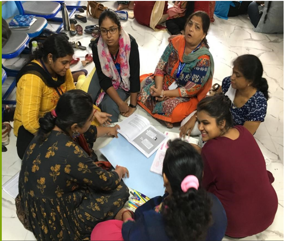
6th to 7th July 2019 - Workshop Activity