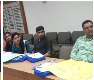
5th to 6th July 2019 - Workshop photos