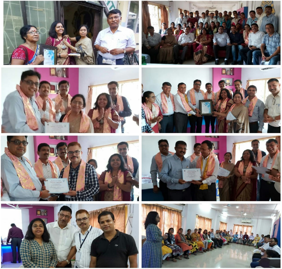
17th to 18th August 2019 - Workshop Activity