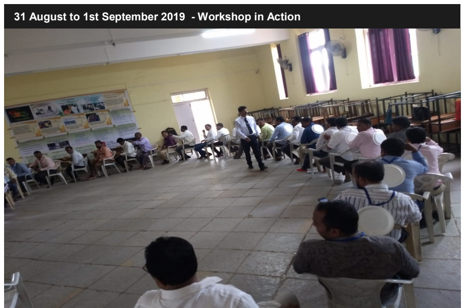
31 August to 1st September 2019 - Workshop in Action