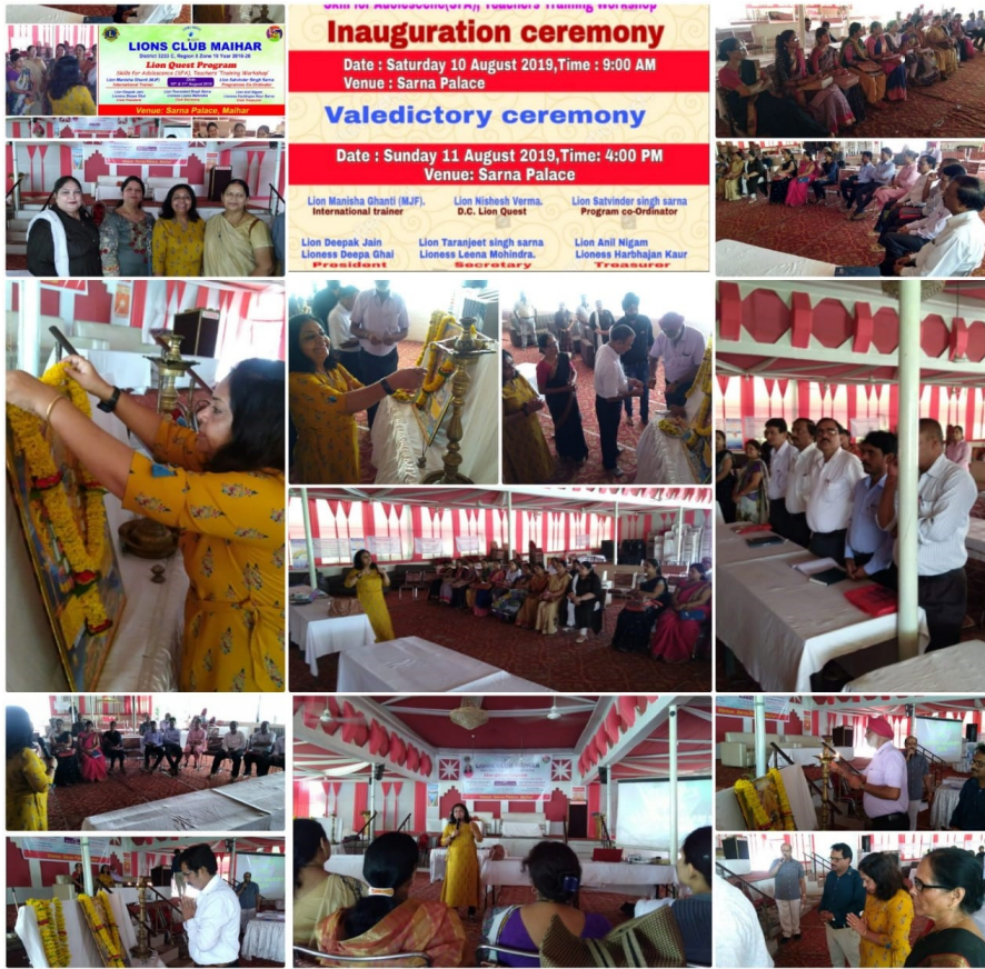
10th to 11th August 2019 - Workshop in Action