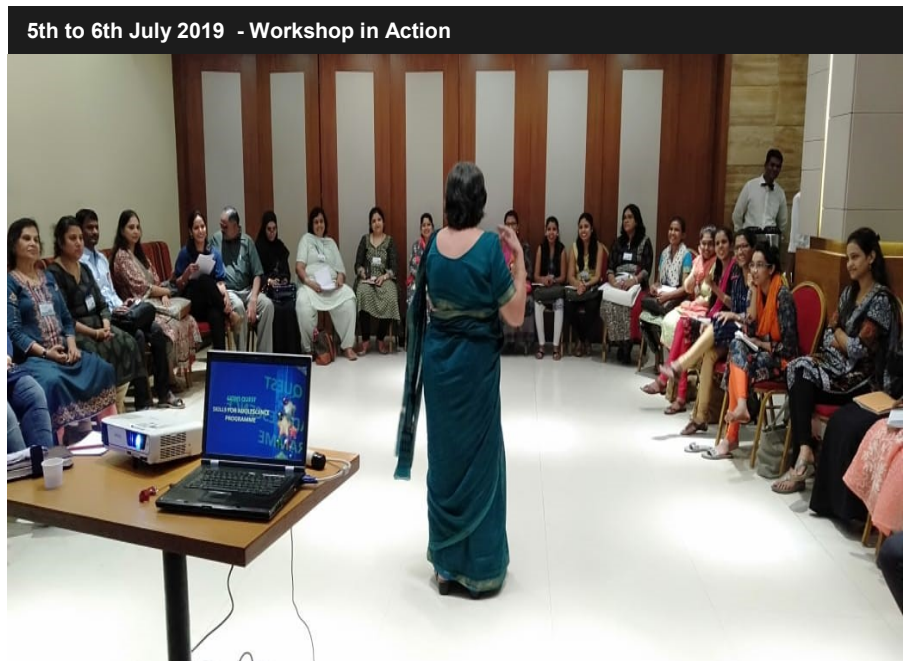
5th to 6th July 2019 - Workshop in Action