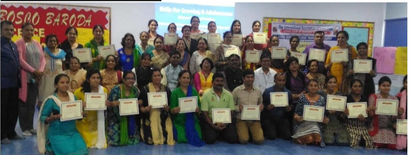
16th to 17th August 2019 - Workshop in Action