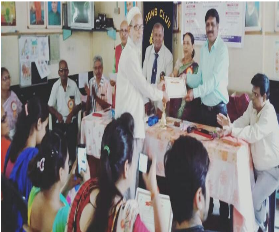
20th to 21st July 2019 - Workshop in Action