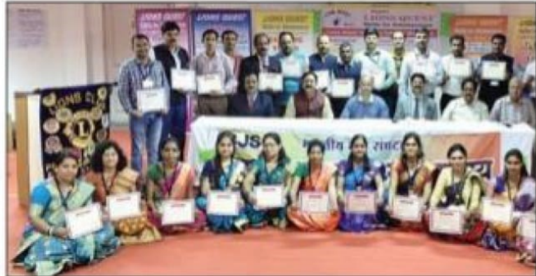
वाघोली : येथे भारतीय जैन संघटना विद्यालयात शिक्षक कार्यशाळा पार पडली.