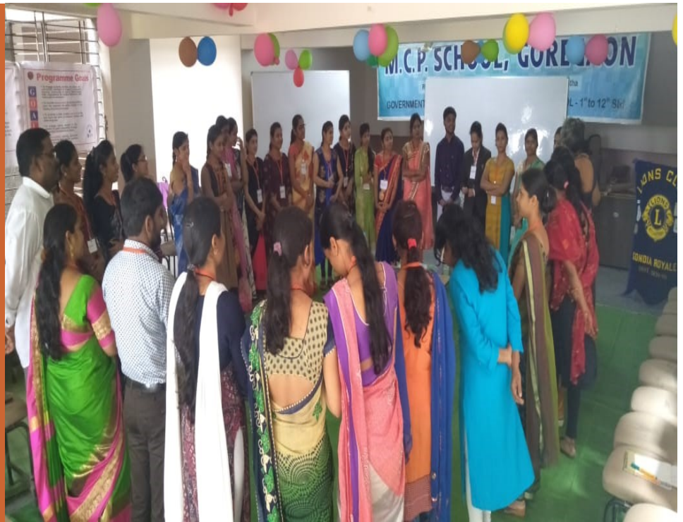
10th to 11th Sep 2019 - Workshop in Action