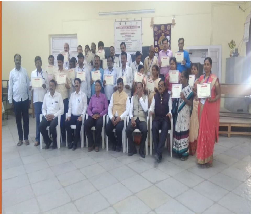
21st to 22nd Sep 2019 - Workshop Photo