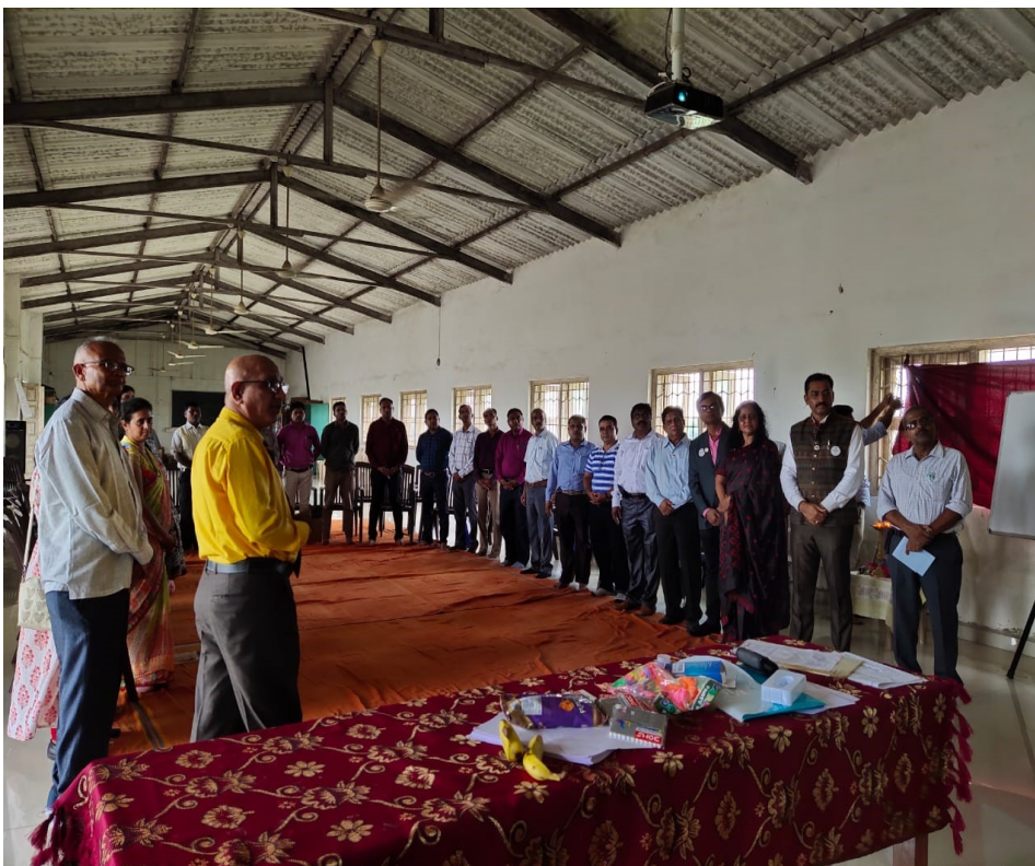
5th to 6th Oct 2019 - Workshop in Action