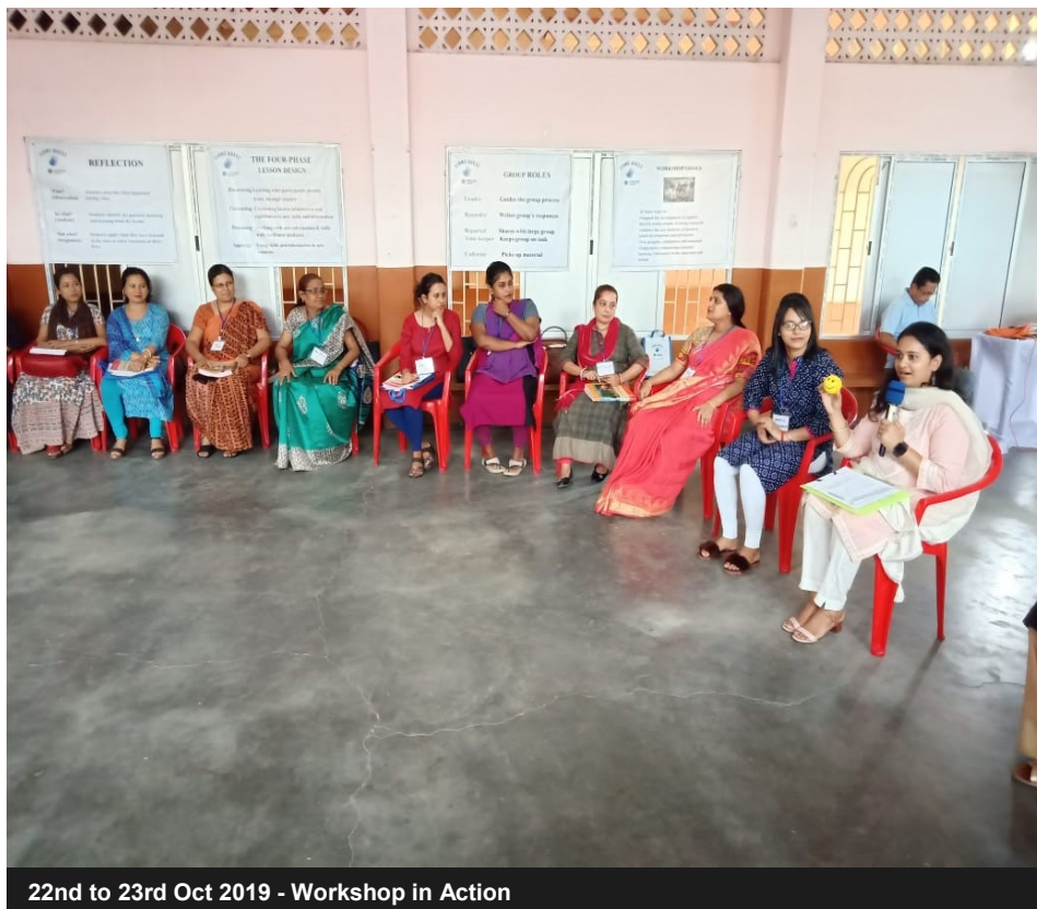
22nd to 23rd Oct 2019 - Workshop in Action