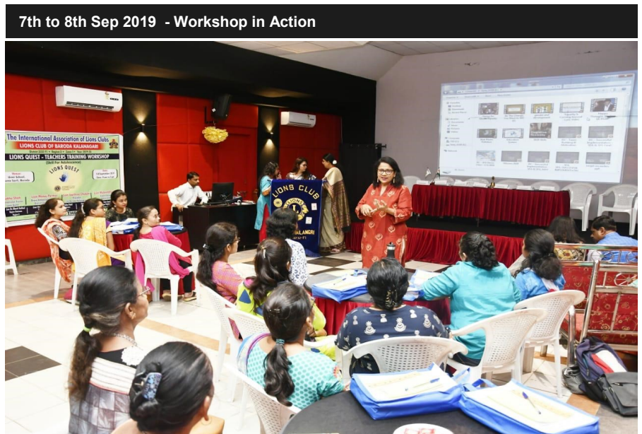
7th to 8th Sep 2019 - Workshop in Action