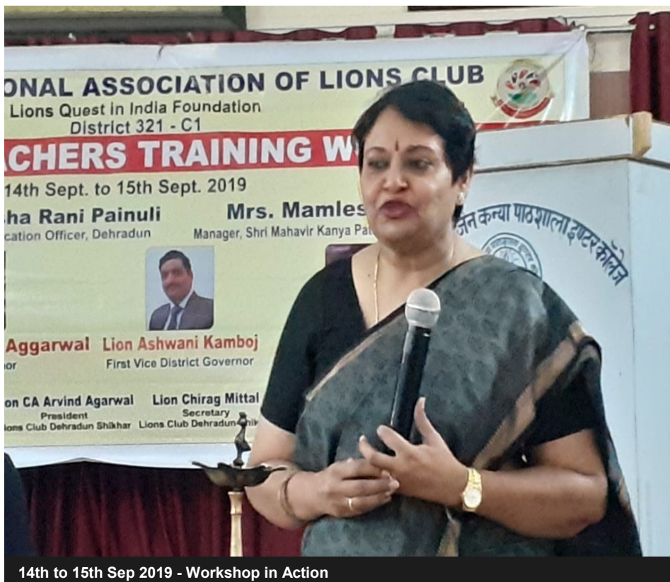
14th to 15th Sep 2019 - Workshop in Action