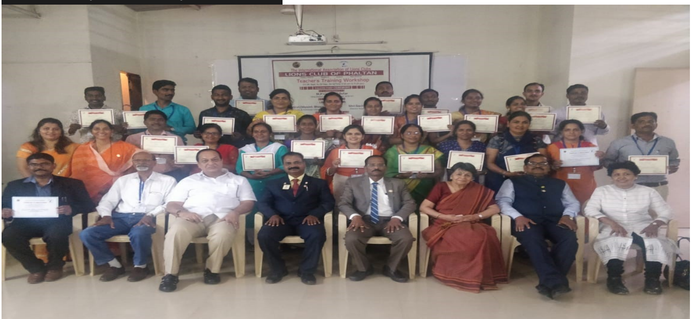
28th to 29th Sep 2019 - Workshop Photo