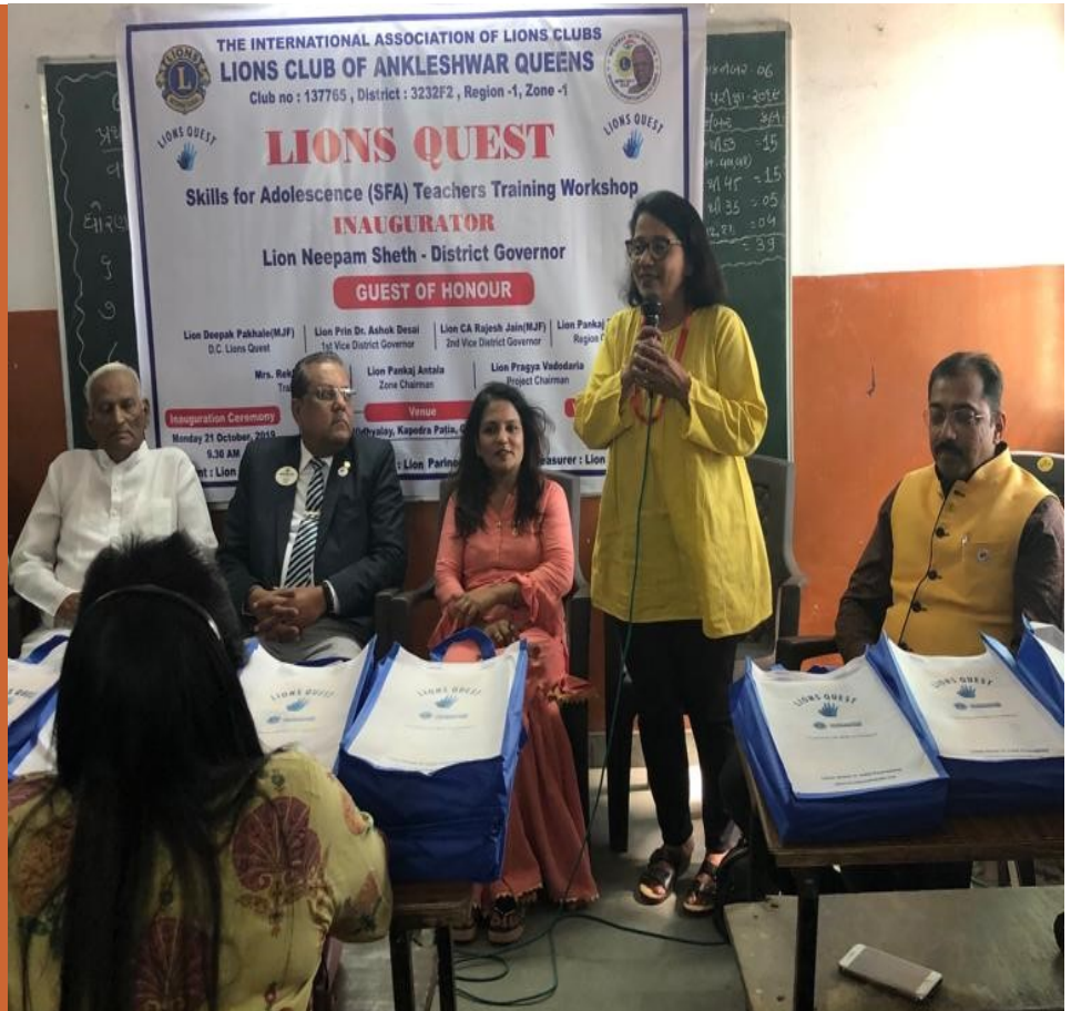
21st to 23rd Oct 2019 - Workshop Activity