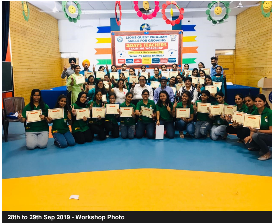
28th to 29th Sep 2019 - Workshop Photo