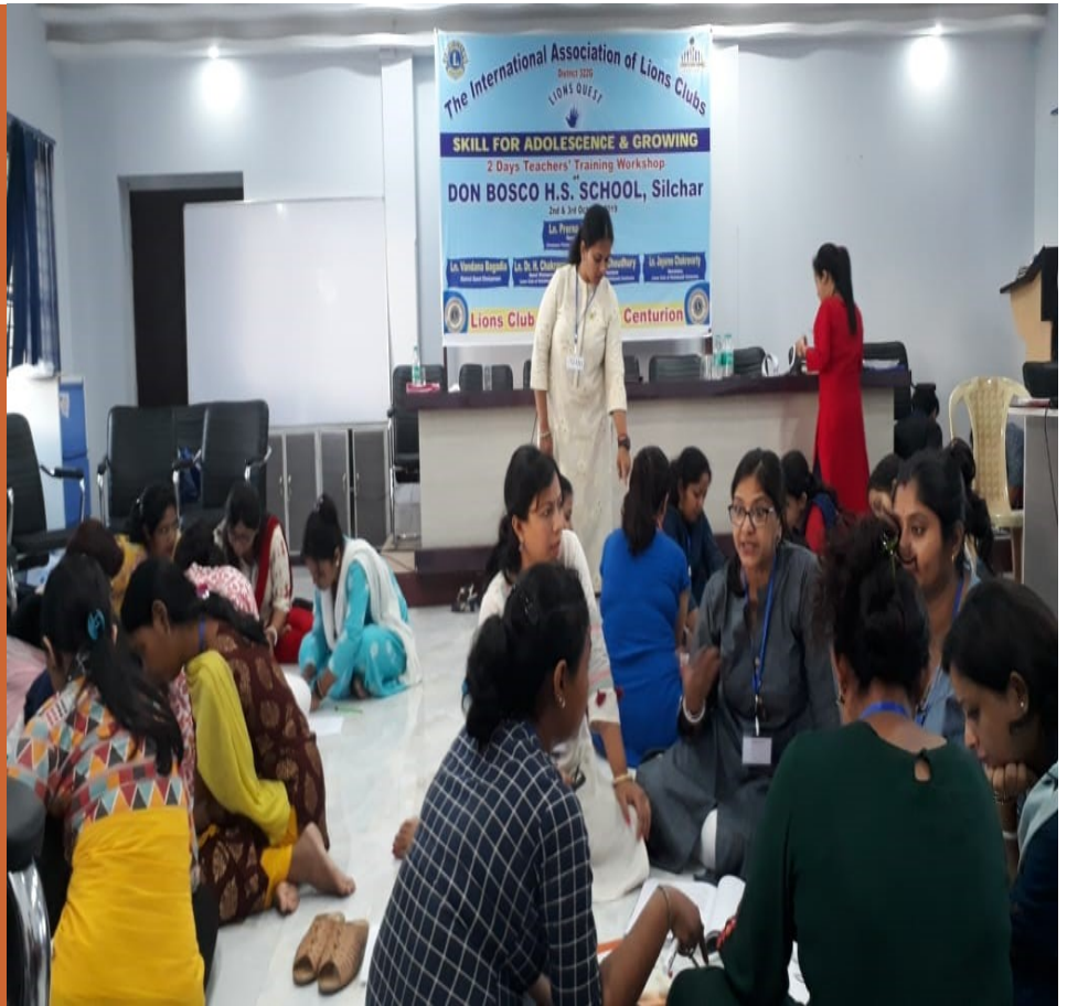
2nd to 3rd Oct 2019 - Workshop Activity