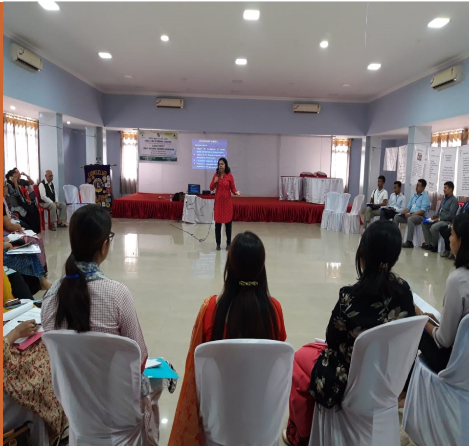
29th to 30th Sep 2019 - Workshop Activity