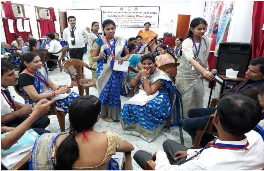
7th to 8th Sep 2019 - Workshop in Action