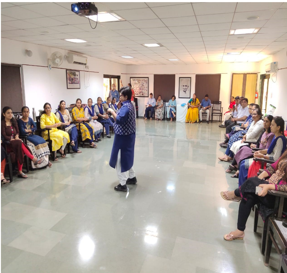
23rd to 24th Sep 2019 - Workshop in Action