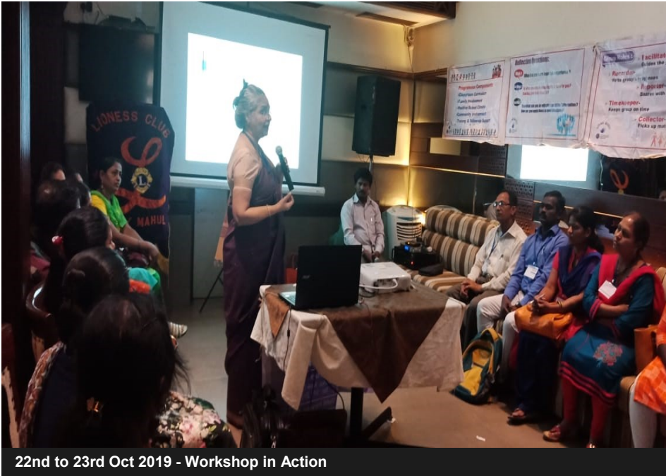
22nd to 23rd Oct 2019 - Workshop in Action