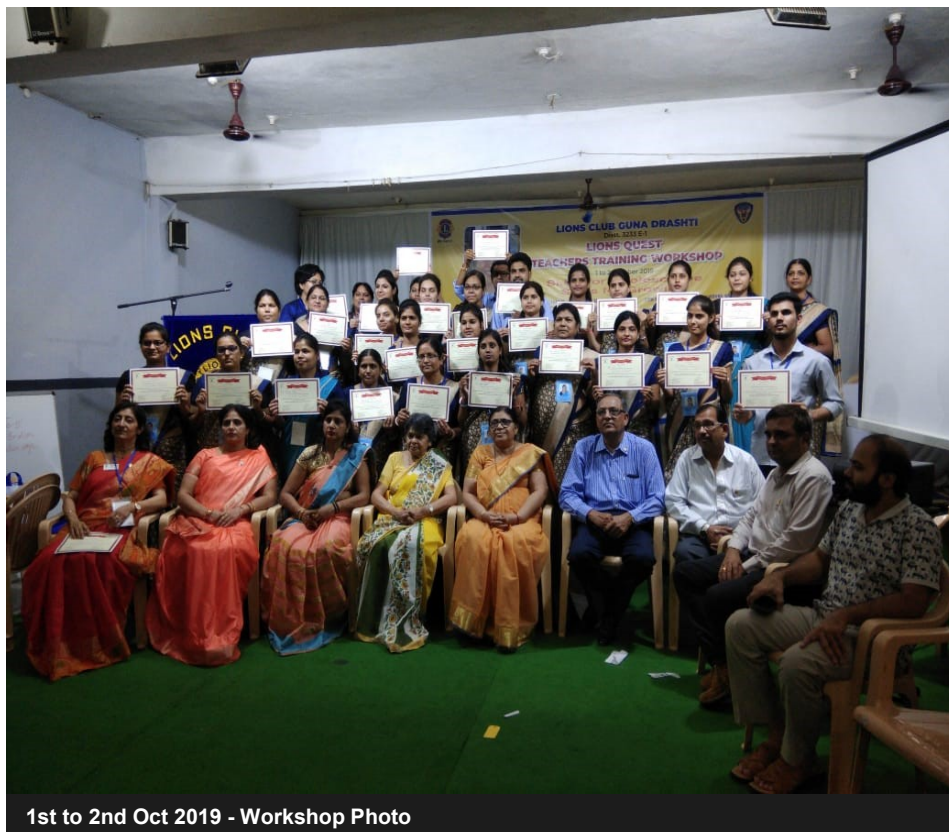
1st to 2nd Oct 2019 - Workshop Photo